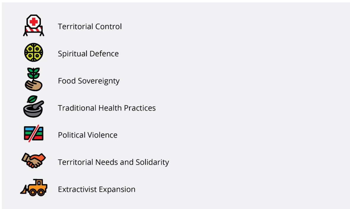
Figure 1. Mapping categories and icons. Icon design by Sergio Iacobelli

independent news site such as El Ciudadano and El Mostrador . Between July and August 2020, we published the updated dataset once a week on the Mapuexpress website.